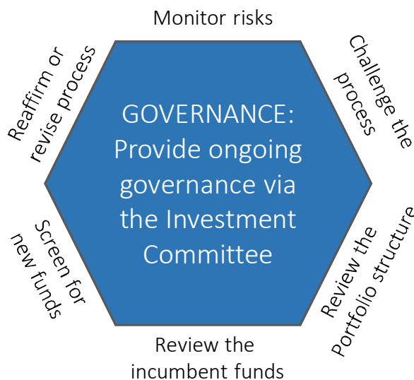
Figure 2: Key areas of responsibility of the Investment Committee

It is perhaps evident that a firm's Investment Committee should be focused predominantly on the risks that have been taken in the portfolio – both at portfolio structure and at a fund level – rather than discussion whether now is the time to jump in or out of markets or which manager to hire and which to fire. The figure below highlights the key areas that the Investment Committee is responsible for.